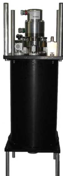
Callisto's Ultra Cryogenic LNA