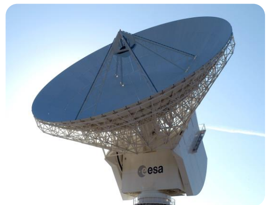
Typical installation site: ESA 35m Deep Space Antenna

The specifications provided in this data sheet are preliminary and intended as a guide only. Callisto reserves the right to modify specifications without notice.